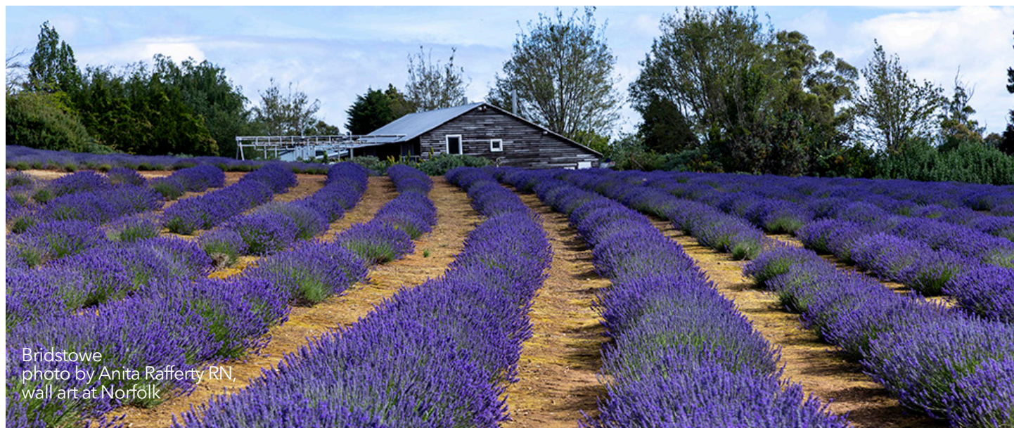
Bridstowe, wall art at Norfolk

For more information, www.myagedcare.gov.au or call My Aged Care on 1800 200 422 .