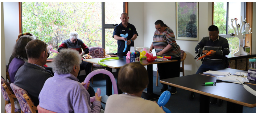
Bisdee clients have been practising making flower balloons