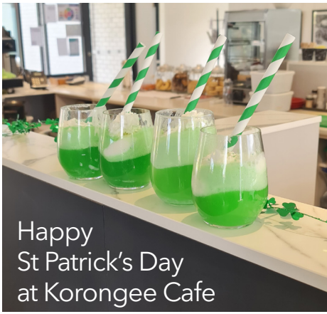
Happy St Patrick's Day at Korongee Cafe