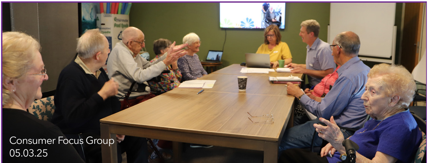
Consumer Focus Group 05.03.25

of interest was what we are doing to support the environment, which we will incorporate and report back to our community.