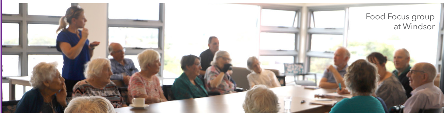
Food Focus group at Windsor

Executive Manager Finance + Corporate Services