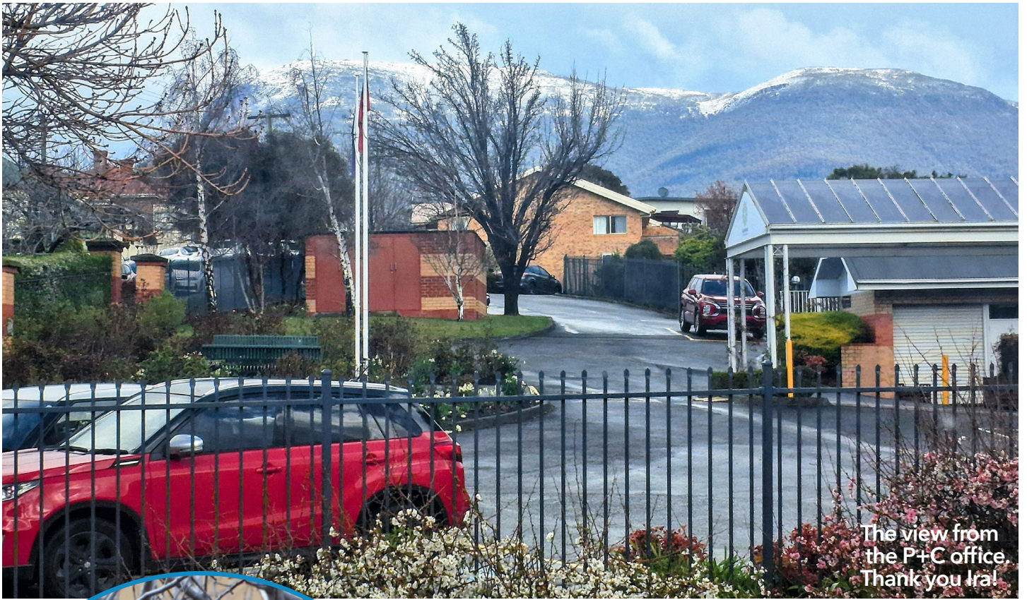
The view from the P+C office. Thank you Ira!